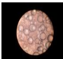
Fig 1: Mint

Place some drops of encapsulated liquid on the slide and the size is determined by using a graduated ocular micrometre using 40X magnification.