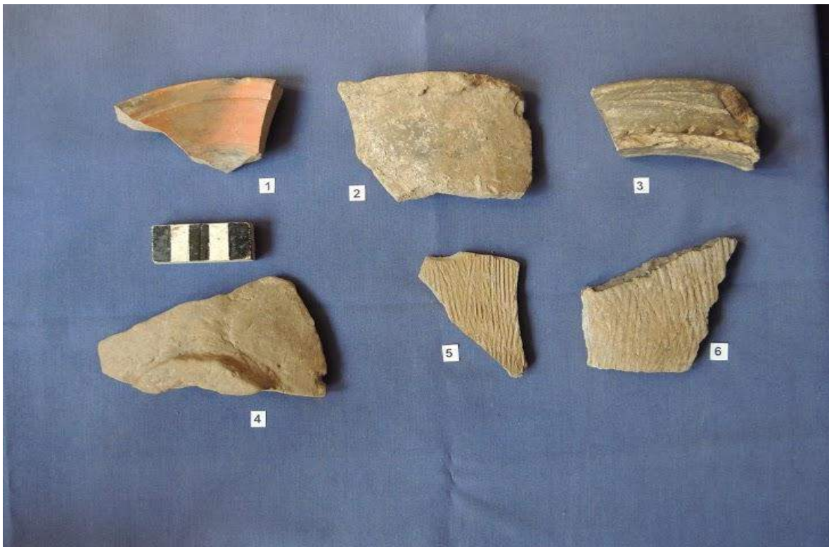
Plate IV Pot Shreds from Hariparigom