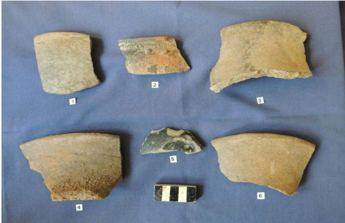
Plate I Neolithic Pot Shreds from Gufkral