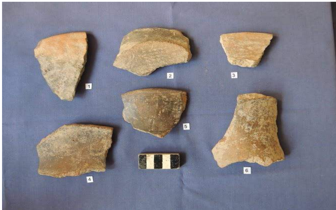
Plate II Pottery from Waztal