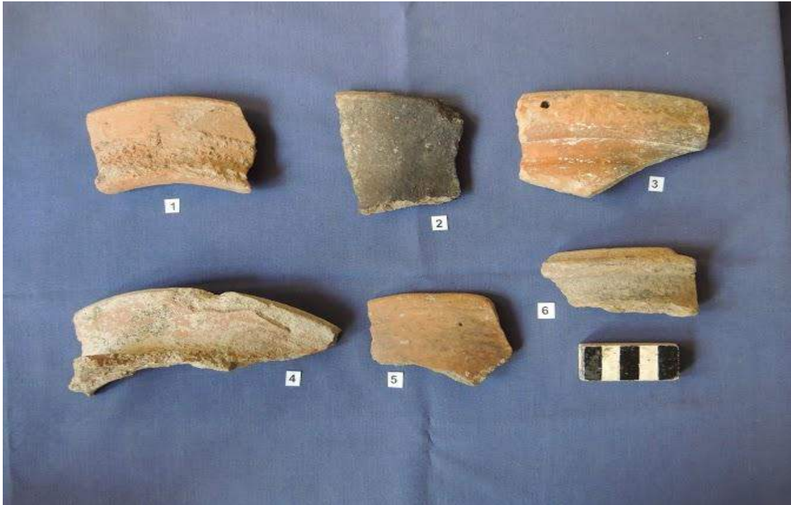
Plate III Pottery from Sombur