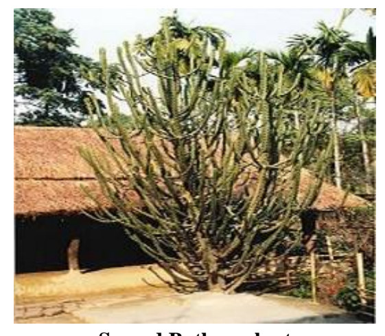
Sacred Bathou plant

The Meches have still retained their distinctive Septs or Gotras. They have five or seven principal Gotras. They are associated with the objects other than human that might be the remnants of some form of totemism as probably practised earlier. The most common Gotras, found among the Meches in the Dooars today, are following, Sampram-ari or Campram-ari (the priestly class), Narzin-ari, (the warrior class), Basumat-ari (landlords and cultivators), Bargaon-ari, Iswari-ari, Moch-ari and Hajo-ari. The suffix 'ari' means Sept or Gotra. In some early literature, more numbers of septs are mentioned among the Meches and Bodos.