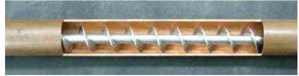
FIGURE 1: The inner tube fitted with the full-length helical tape.

Research Methodology The research methodology involves the prediction of flow and heat transfer behaviors, the available flow procedures for swirling flows and boundary layer are employed to solve the heat transfer calculations.