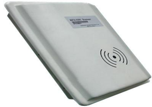
Fig : RFID Receiver

radio Frequency (RF) transmitter and collector, controlled by a microchip or advanced sign processor.