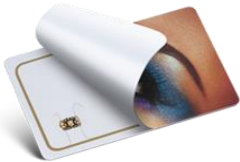
Fig : RFID Tag Card

In this technique an active reader, which transmits interrogator signals and also receives authentication replies from passive tags